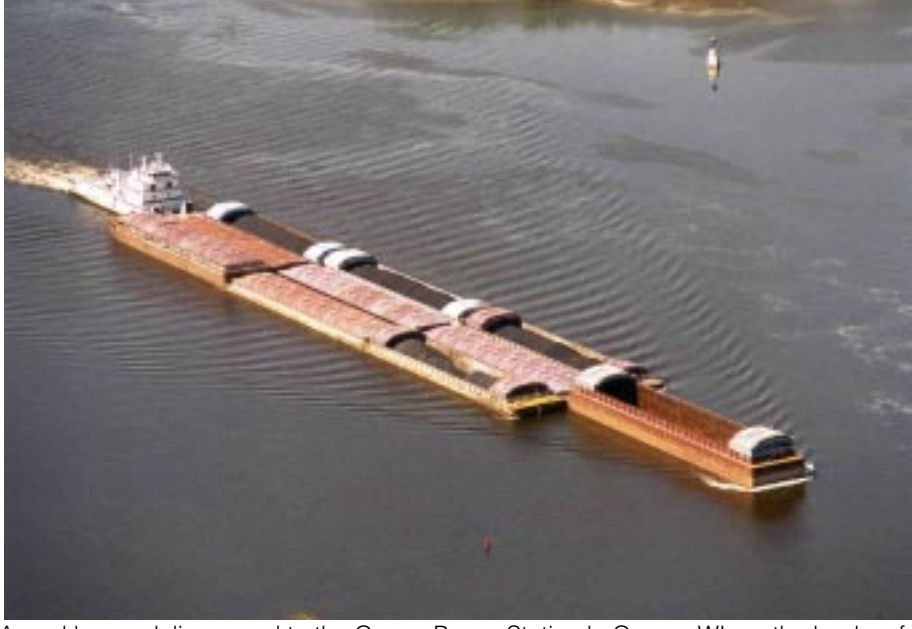
A coal barge delivers coal to the Genoa Power Station In Genoa, WI, on the banks of the Mississippi River. The Genoa Plant burns around 1 million tons of coal annually.

Officials at Dairyland are hopeful that prices will level off for coal supplies in late 2002, but time will tell. Coal has been a lower-price resource for many years, and its price is now starting to escalate.